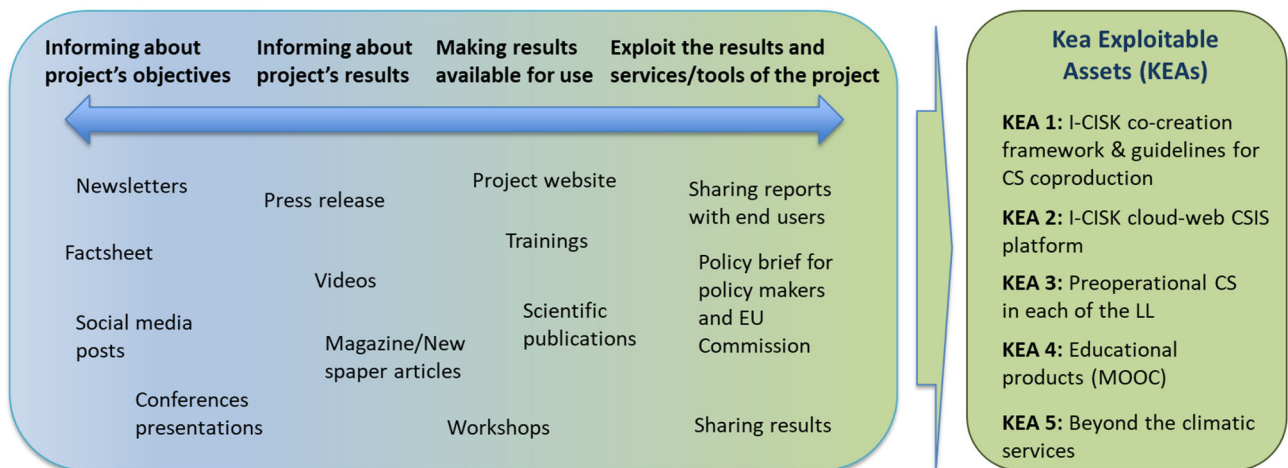
Figure 1: From communication and dissemination to exploitation (modified from: PrimeWater project, D6.6, 2023, Grant Agreement No 870497)

There is an established connection between dissemination, communication and exploitation activities. In this connection, exploitation can be defined as the utilisation of results in (1) further research activities other than those covered by the action concerned, (2) developing, creating and marketing a product or process, (3) creating and providing a service and (4) standardization activities, as summarised in Figure 1.